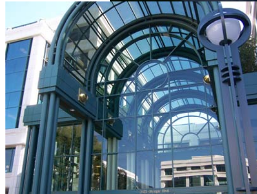
The Water Gardens — Retail / Office / Restaurants