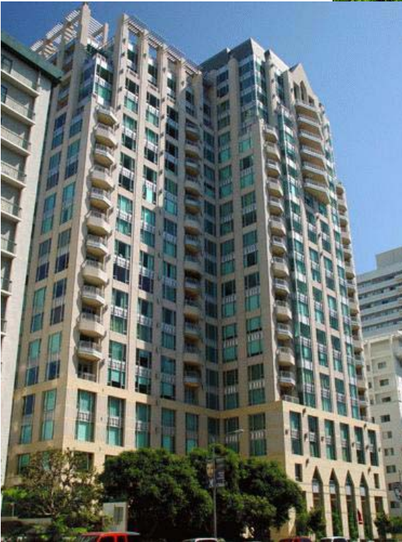
The Remington — 23 Story, 93 Units