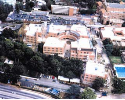
The Anderson School — UCLA