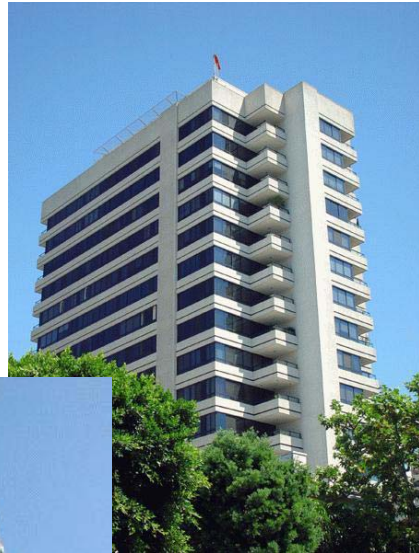
The Diplomat—18 Story, 65 Units